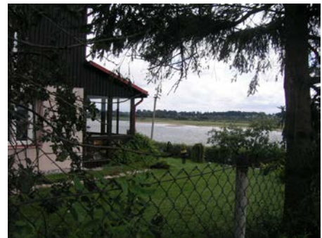
View to River Nemunas