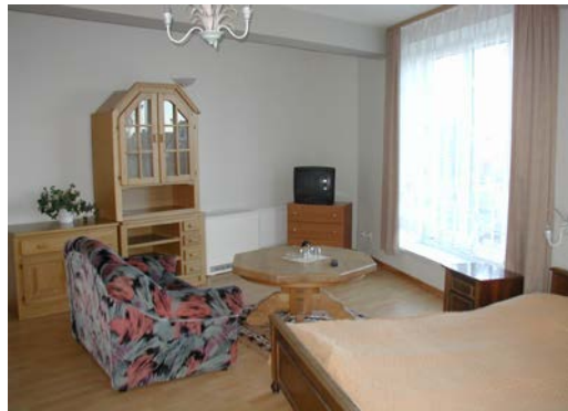
Combined Sleeping/Living area of a suite

Special features of the hotel (extra charge): Turkish steam bath, Finnish sauna, swimming pool, tennis, fitness center, mini golf, billiards, massage, underwater massage, other medical applications. Conference room, banquet facilities. Car and bicycle rental, ATM, information centre. All activities such as sailing, fishing, are also available.