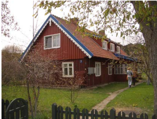
Pas Danute, view outside

Studio flat in the South of Nida in a listed original Fisherman's House from 1912. This Studio is a successful combination of old couronian architecture and comfortable living in the attic with flair. Living and sleeping unit go into each other over, a kitchenette completes this area, a bathroom with shower and WC is available. The apartment is ideal for two people, which want to live in authentic nostalgia, avoid interchangeable comfort without having to forgo the comforts modern living.