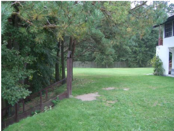
Parking area for campers