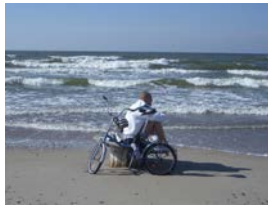
At the Baltic Sea