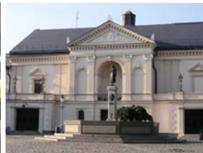
„Aennchen von Tharau“