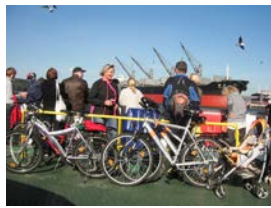
Ferry to the Spit