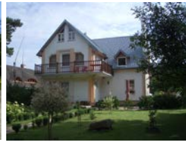
Guesthouse „Misko Takas“