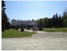
The Amber Castle Palanga