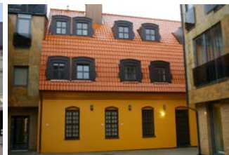
Hotel Euterpe, Klaipeda