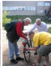
Rent a bike