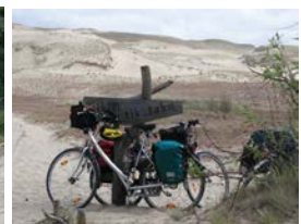
The „Grey Dunes“