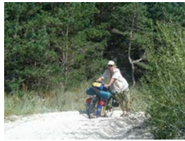
Through the Duenen