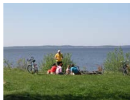
View back to the Spit