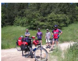
Make a break