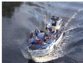
By boat over the Lagoon