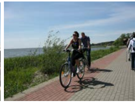
Bicycle trail Nr 10