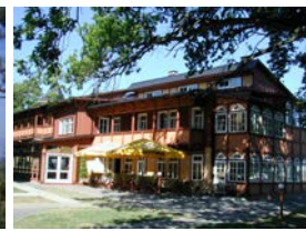
Hotel „Villa Flora“