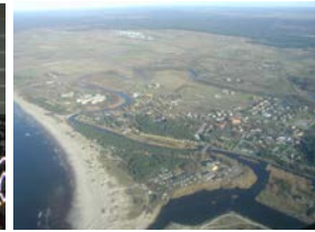
Auf Wiedersehen Litauen