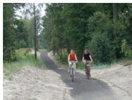
On tour to Nida