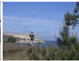
The Curonian Spit