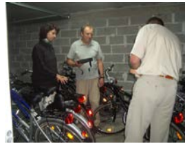
Abgabe der Fahrraeder