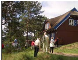
Thomas Mann House, Nida